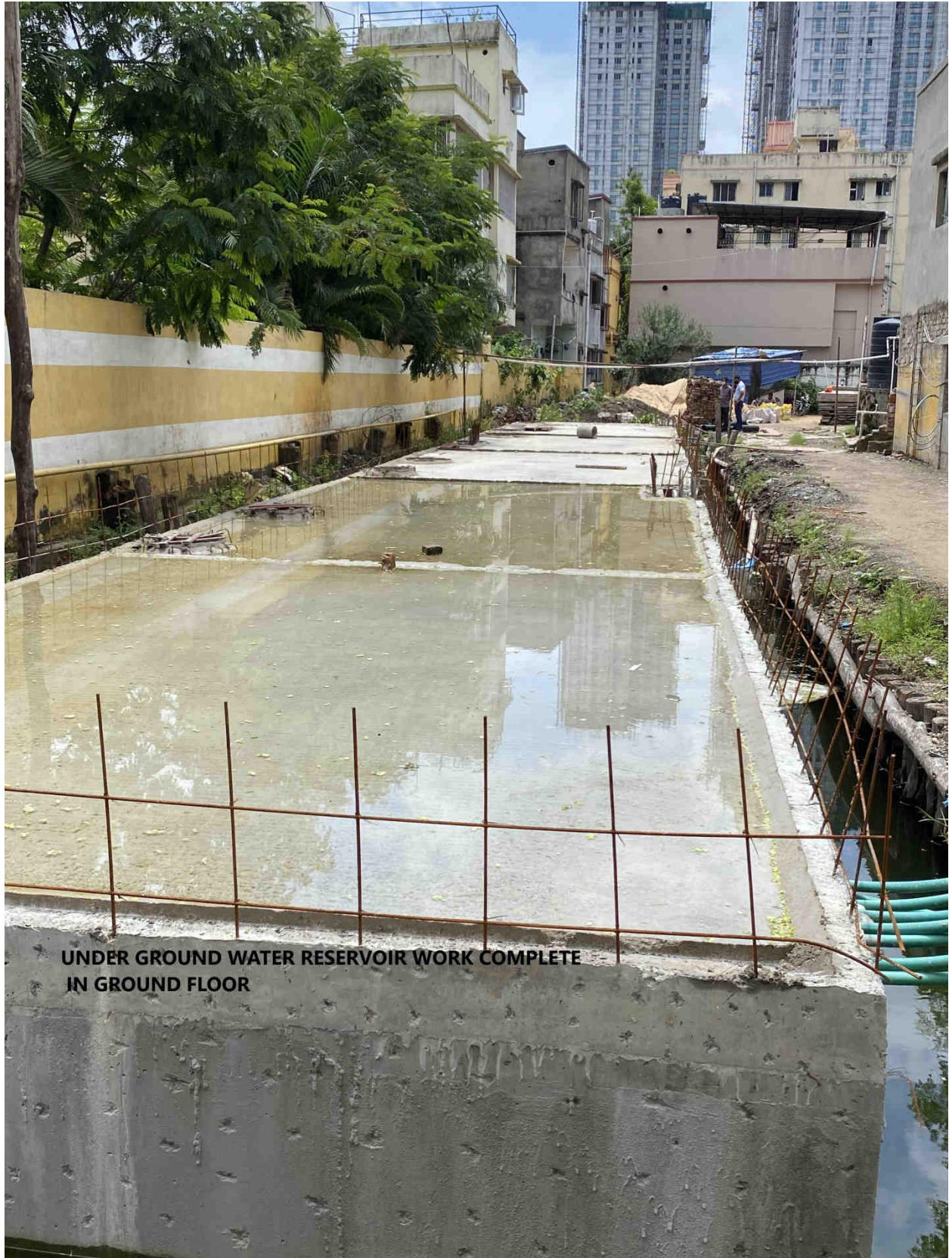
UNDER GROUND WATER RESERVOIR WORK COMPLETE IN GROUND FLOOR