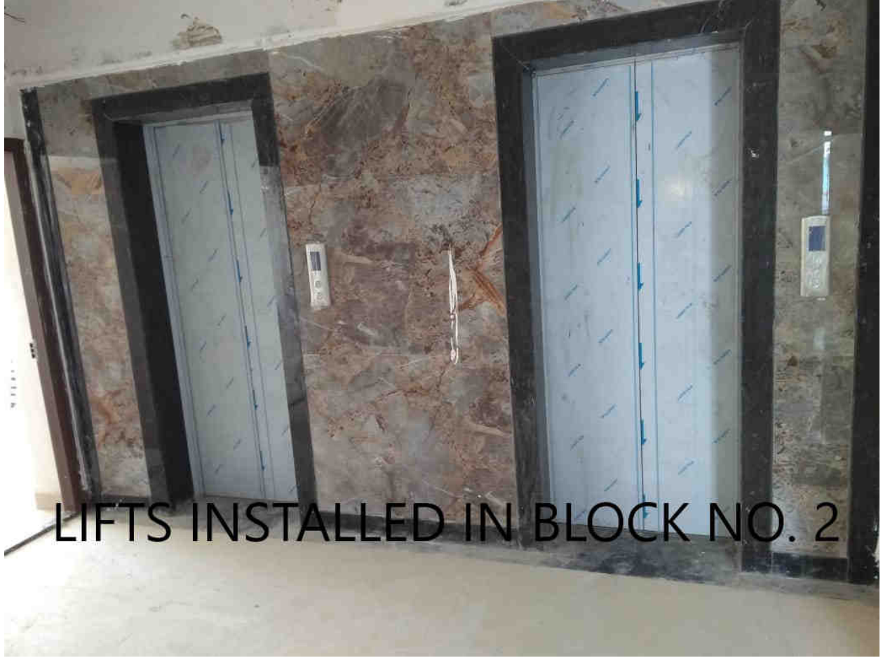
LIFTS INSTALLED IN BLOCK NO. 2